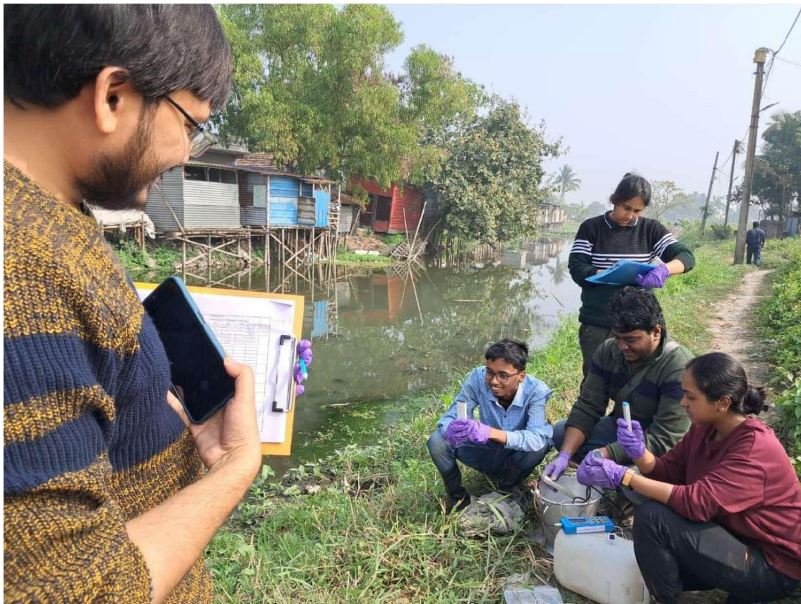
Collection of polluted water for further experiments in the laboratory