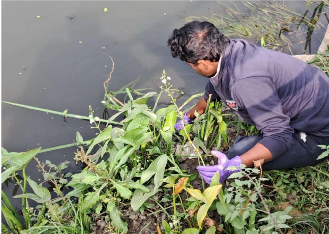
PhD student transplanting Acorus plantlets for bio-remediation purpose in Khardah Canal of Kolkata, West Bengal