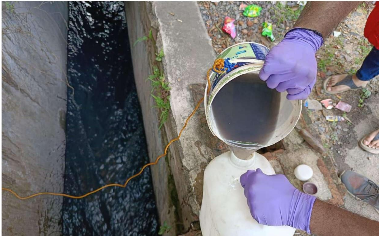
PhD students collecting domestic sewage waste effluent from drains